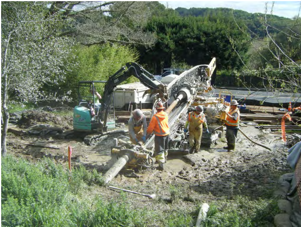
Photo 3. Klemm drill being utilized for the borehole drilling of BH-2 at the Underhill Site location.