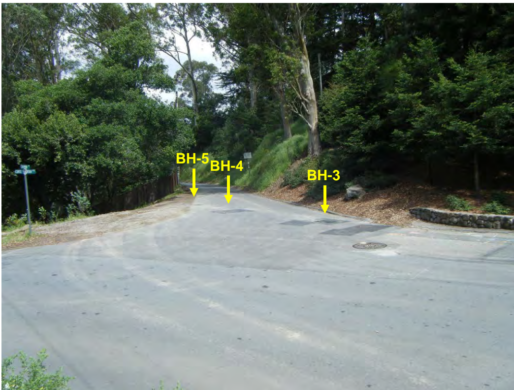
Photo 2. Location of investigation at Chapman site after restoration.