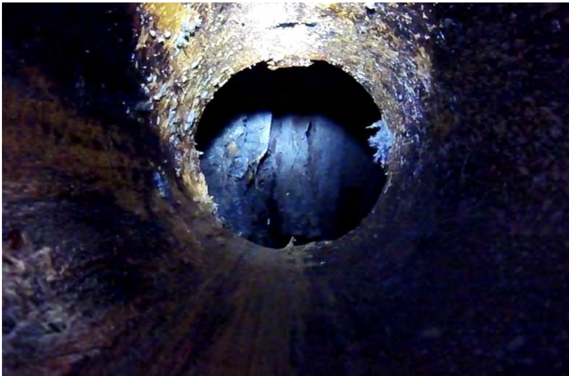
Photo 8. View through bottom of casing of Borehole B-3 showing fibrous wood debris.