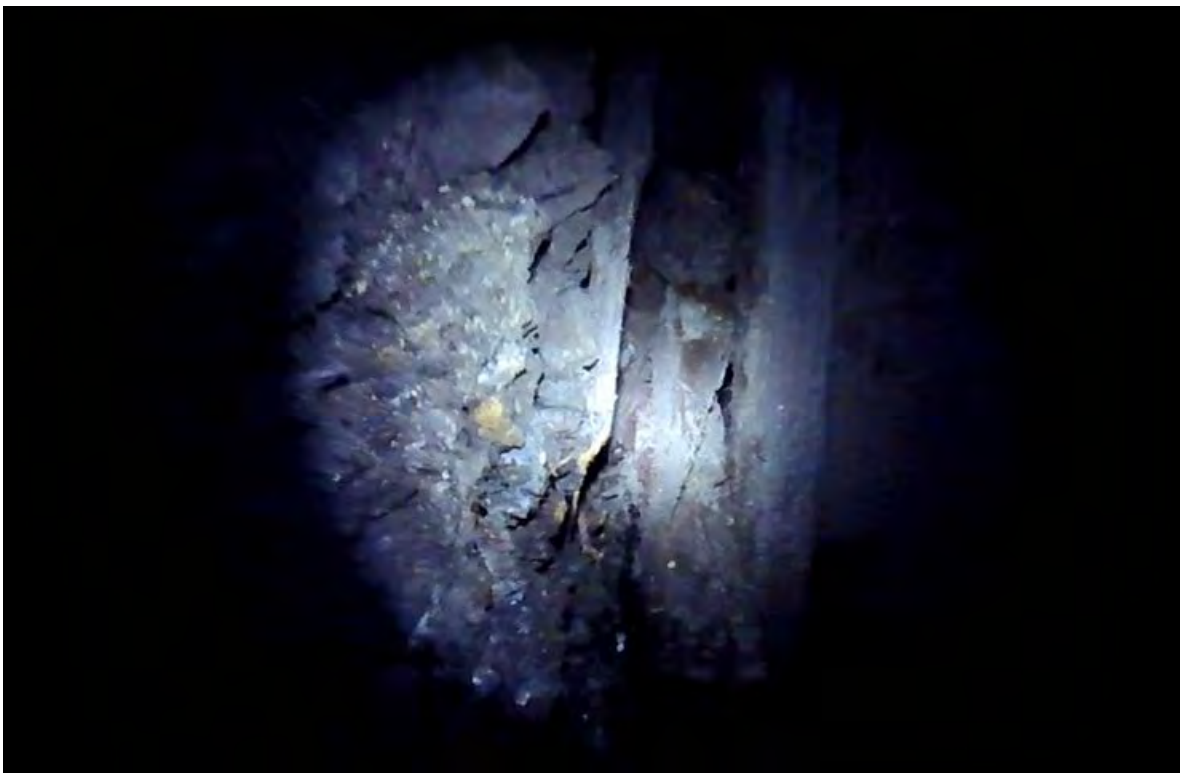
Photo 10. View of bottom of Borehole B-5 showing fibrous wood debris.