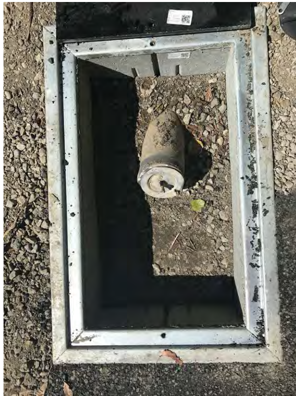
Photo 5. Typical concrete Christy box installation to seal each borehole following the investigation.