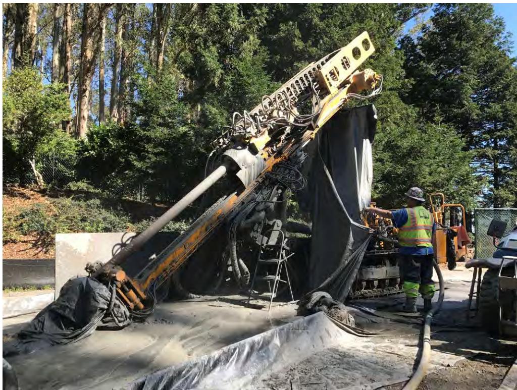
Photo 4. Klemm drill being utilized for the borehole drilling of BH-3 at the Chapman Site location.