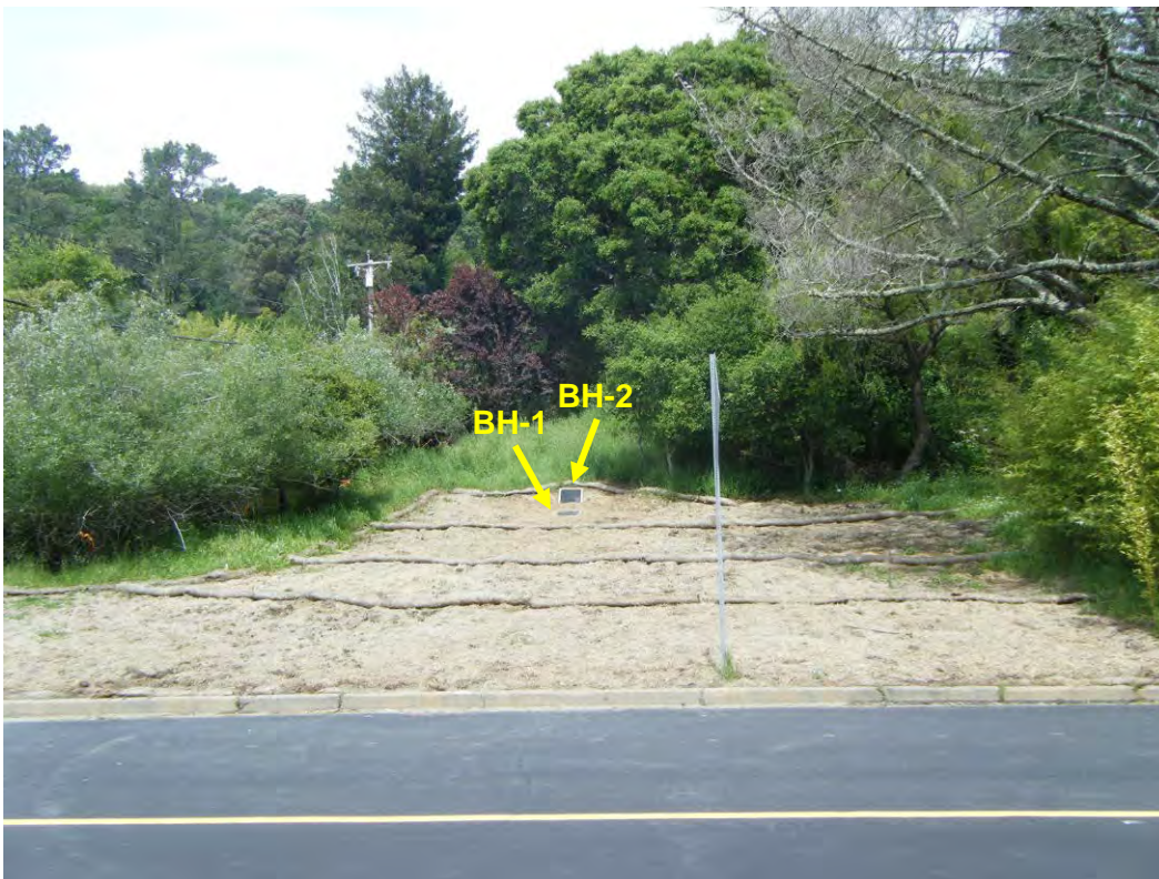
Photo 1. Location of Investigation at the Underhill site after restoration.