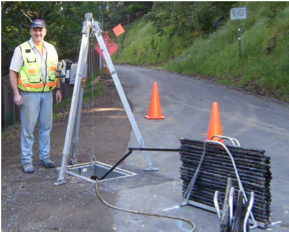
Photo 11. Renishaw was on-site for deployment of the cavity and tunnel scanning equipment.