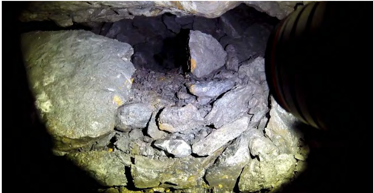
Photo 6. View of bottom of Borehole B-1 showing void area filled with collapsed material.