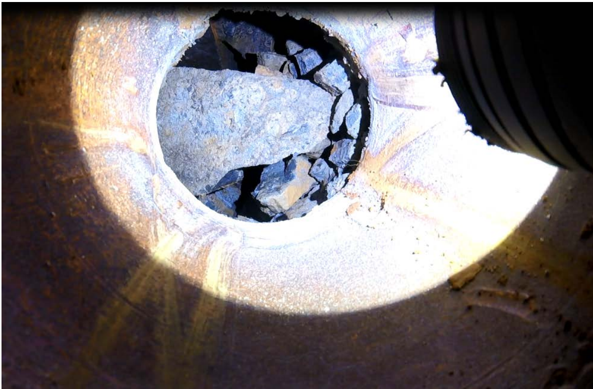
Photo 7. View through bottom of casing of Borehole B-2 showing void area filled with collapsed material.