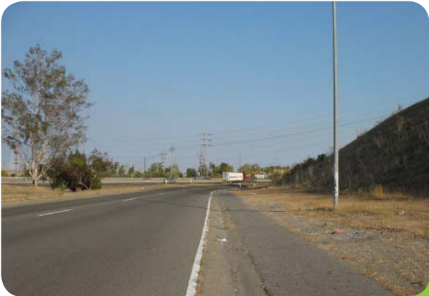
The existing path (above and right) on South Novato Boulevard ended at the freeway onramp; cyclists had to ride on the shoulder on to Highway 101 at the highway 37 merge. The project now (below and right) provides a pathway separated from the freeway through this corridor.