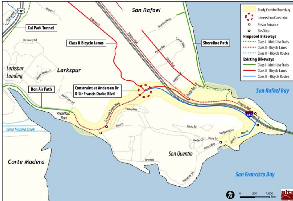
Facilities shown above are from the Bicycle/Pedestrian Master Plan and do not necessarily reflect the conceptual improvements considered in the Study.