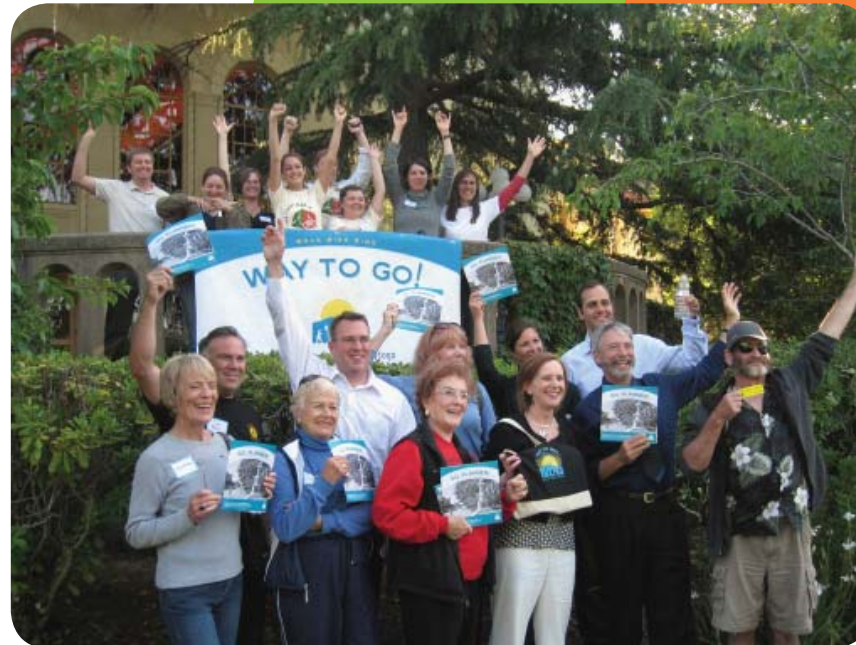
Residents, staff, and supporters celebrate the kick-off of the Way to Go! Sausalito program in 2008.