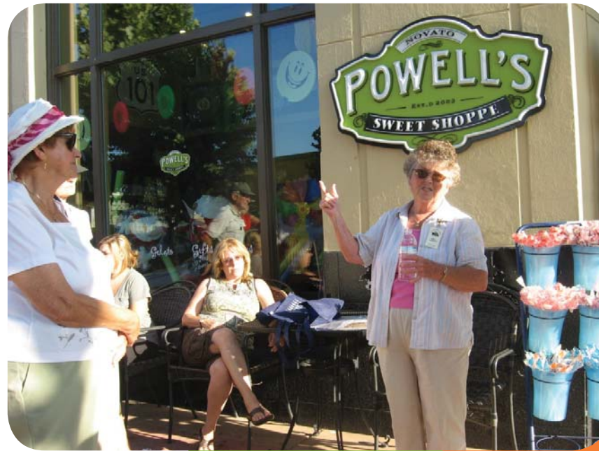
Novato's rich history and knowledgeable local docents made for a great guided walk through the historic district as part of Way to Go! Novato program in 2009.