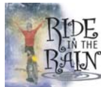
University of Washington