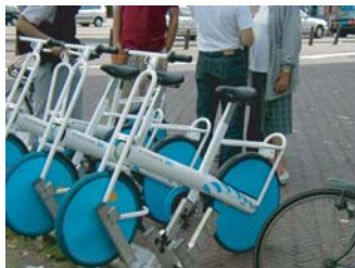
Hampshire College Hampshire.edu