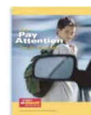
Metropolitan Washington Council of Governments